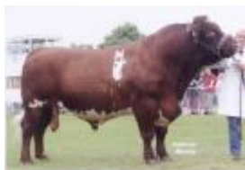
East of England – Supreme inter breed Beef Champion - Tarrant Paladdin

Beef Shorthorns are going from strength to strength. They have recorded many interbreed successes at shows this year including the following: