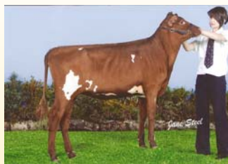
Reserve Champion Strickley Geri 15

More pictures and results will be in the 09 Journal