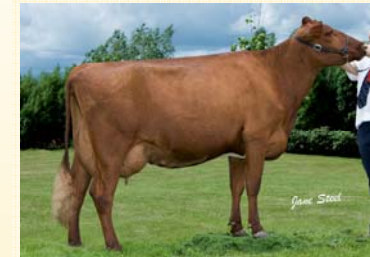
Champion Rodway Sonnchein 15th

It was a wonderful start to our World Shorthorn Conference tour and the large crowd round the judging ring confirmed the renewed interest in our breed.